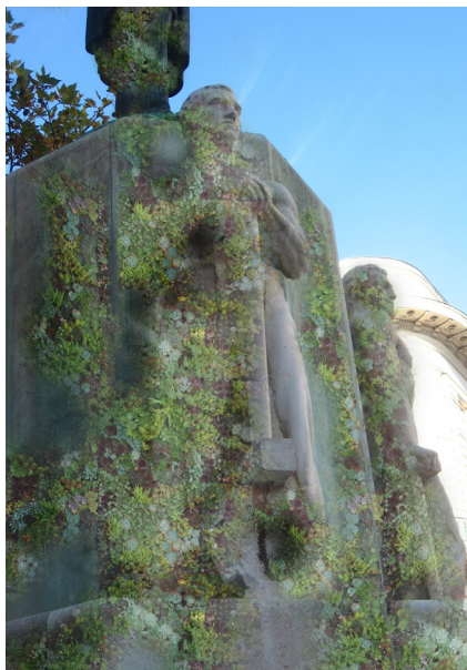
Figure at the front (man with gas pipe) - Proposal