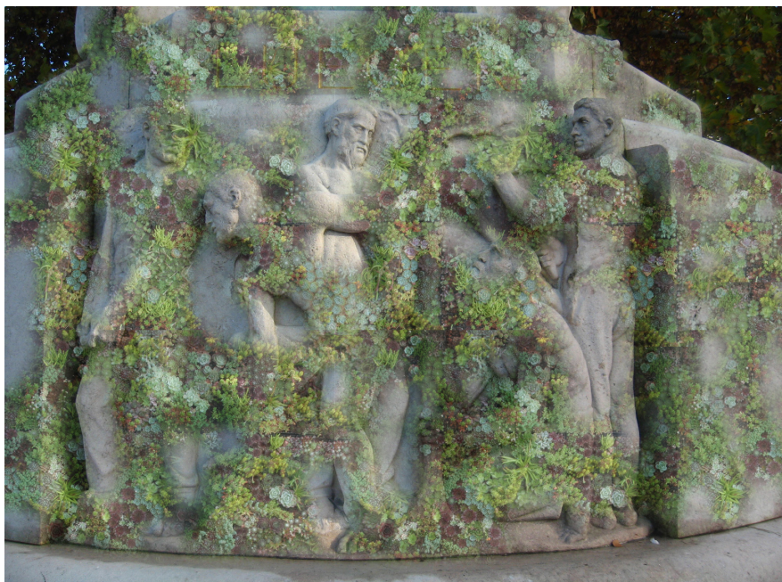
Front relief (creation of the wood and grass area) - Proposal