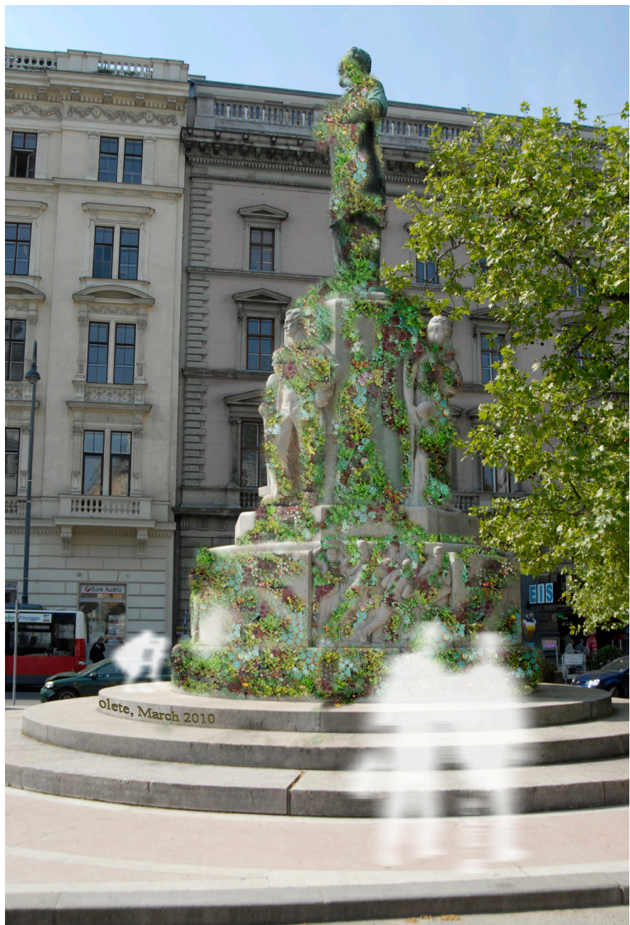
Site of the Lueger Platz - Proposal